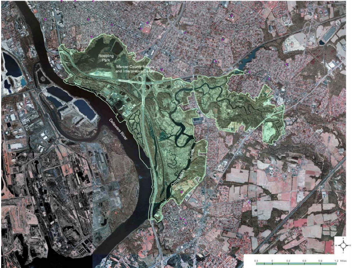
Map. 1. Extent of the Hamilton – Trenton – Bordentown Marsh is shown in green over an aerial photograph. In addition to wetland areas, uplands in public ownership are also included. (As of 2009, prepared by Herb Lord).